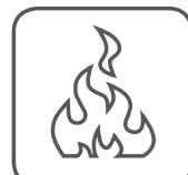
DIN 4102 B1